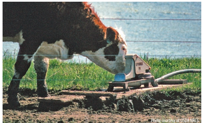
The steer pushes a piston with its nose to power the pump.

Domestic animals should only have access to the pond in a manner that does not introduce contaminants. A nose pump or stock tank can provide water to animals located several feet from the pond. The stock tank should be located at least 50 feet below the pond dam with a gravel or concrete pad around the waterer to reduce mud. At some sites, it will be necessary to use an electric pump or a nose pump to move water from the pond to a higher point of use.