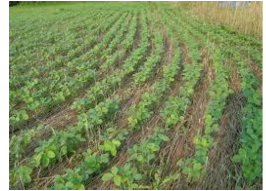
Cover crops help keep your productive topsoil where it belongs...on your field...and build your organic matter in the process

***The LERW 319 grant is designed to improve water quality and lessen the impacts of landscape level pollution throughout the LERW. All projects must prove that they will reduce nonpoint source pollution in the Lower Eel River Watershed.